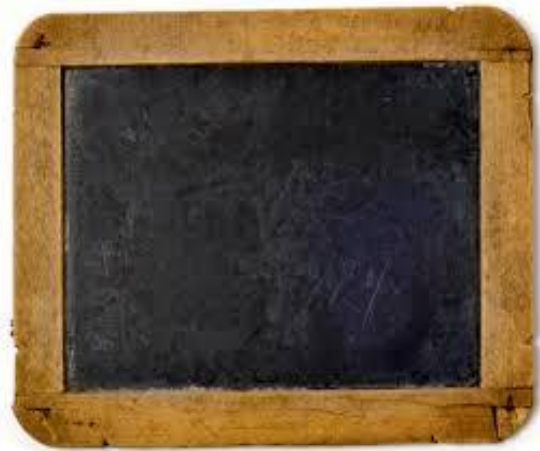
Figure 6. Picture of slate stone fragments on the outskirts of a mine, Britain: Larger pieces of slate stones were used to make writing slates (left) as well as chalkboards.

writing tools and writing surfaces begun to emerge. The surface was called the slate. The slate, made from slate stone (a black metamorphic rock) were used in Indian schools as early as the 11 th Century, and by the 14 th century found quick application in the rapidly expanding school systems of Northern Europe. The slates were originally small (4 × 6 inches), required reinforcement with wooden frames, written on using a slate pencil or chalk. The slates would later mutate into a larger slates called the chalkboard, an important writing tool in the classrooms of 17 th century through to the 20 th century (Figure 6).