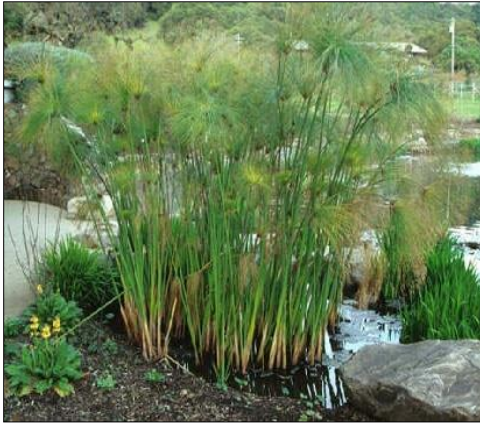
Figure 2. Cyperus payrus

material was called Papyrus. Obtained from the papyrus plant ( Cyperus payrus , Figure 2) a sedge growing along the Nile delta of Egypt, the material was superior not only for its portability but because “it was flexible, smooth and able to retain ink without smudge” (www.historyworld.net). The Egyptians, using a superior ancient technology used adhesives to join several rectangles from papyrus and rolled them to make up scrolls (Figure 3). The papyrus scrolls remained important writing surface during the Egyptian, Greek, and Roman civilization.