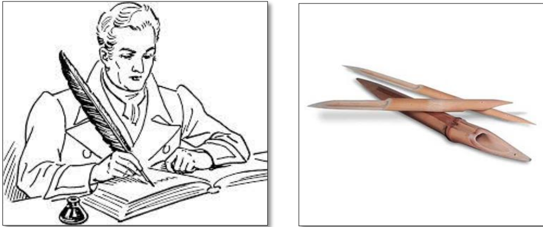
Figure 5. An artistic impression of a calligrapher using a quill pen and a photo of bamboo reed pen: Source: http://www.google.co.ke/url?.wikipedia.org .