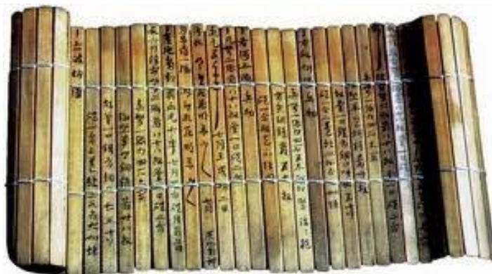
Figure 4. Bamboo Book. Adopted from www.chinatoday.com .

would cautiously squeeze the reservoir to force ink into the nib, making a perfect impression on the parchments.