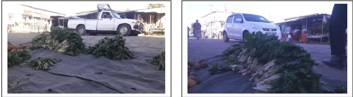
Figure 2: Vegetables were displayed along the dusty roads at Malaa shopping Centre in

were handled compromising food safety. Vegetables were displayed along the dusty roads (Fig 2), washed using dirty water in small basins and cut with dirty hands and knives. The growing concern on food safety among some households triggered the establishment of home gardens.