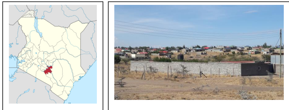
Figure 1: Location of Machakos County and the urbanizing sites in peri-urban areas of Kangundo–Tala

County which has a total population of 99,731 persons. The area is rapidly urbanizing with real estate businesses putting up large gated communities in addition to hundreds of other standalone new households settling in (Fig 1). The climate of the area is characterized by frequent dry spells which result in recurrent food shortages particularly among low-income earners.