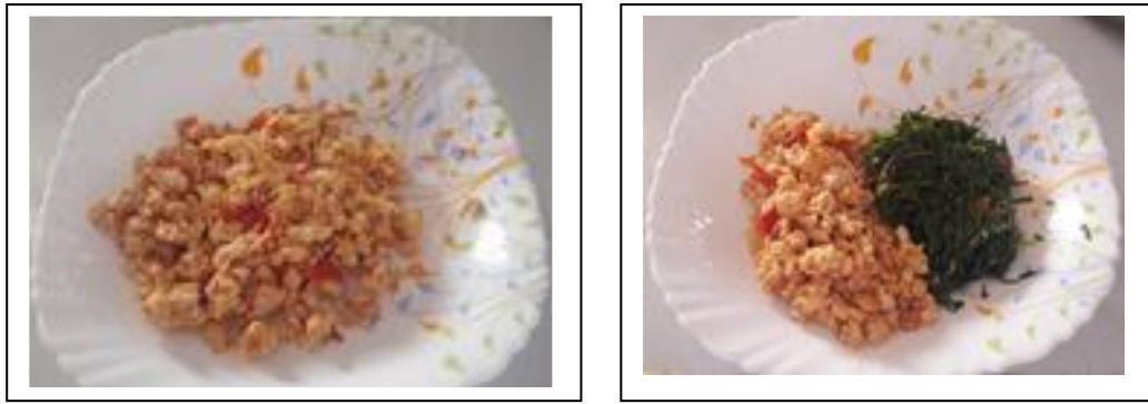
Figure 4: Egg meals prepared as accompaniment for meals

Food expenditure reduction revolved around quick economic access to foodstuffs. Contrary to Galhena et al. (2013) who observe that home gardening supplements the main source of food, in the peri-urban area of Kangundo–Tala home gardening was the main source of accompaniment foods. This was attributed to its accessibility and availability. Consumption of products from home gardens reduced households' food budgets by up to 30%. While this was largely attributed to non-purchasing of accompaniment foods, transport cost to markets was a factor that led to a reduction in food expenditure. Thus, households were capable of meeting their food needs with limited budgets.